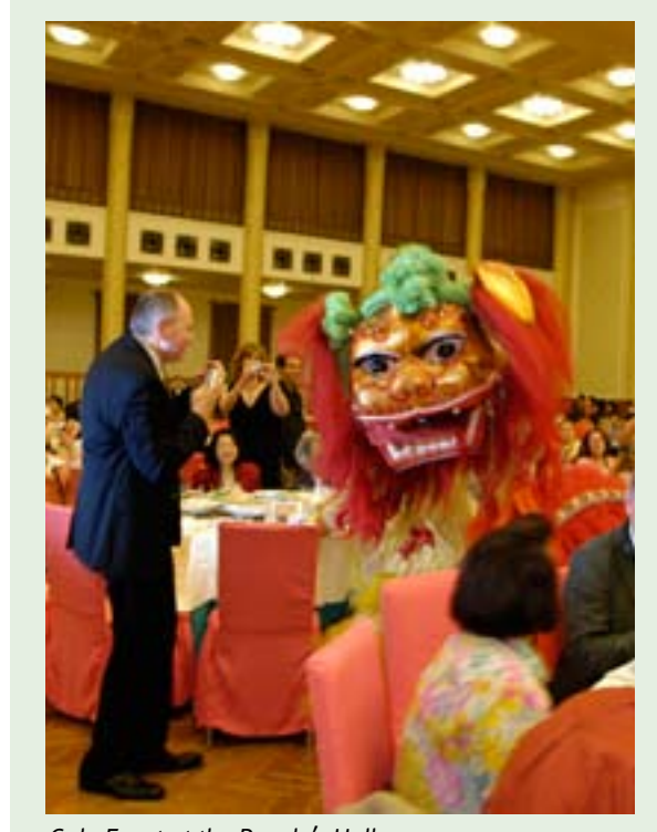
Gala Event at the People's Hall